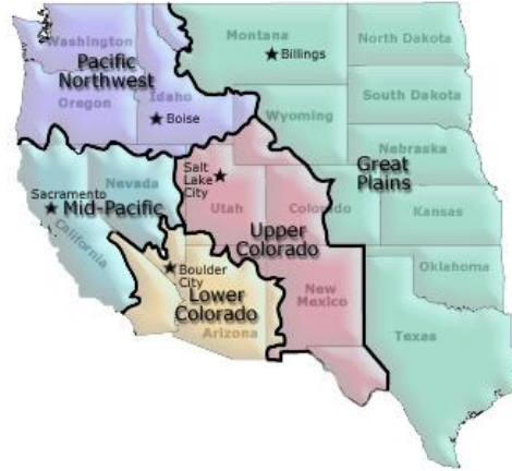
12 Interior Region Names Based on Watersheds